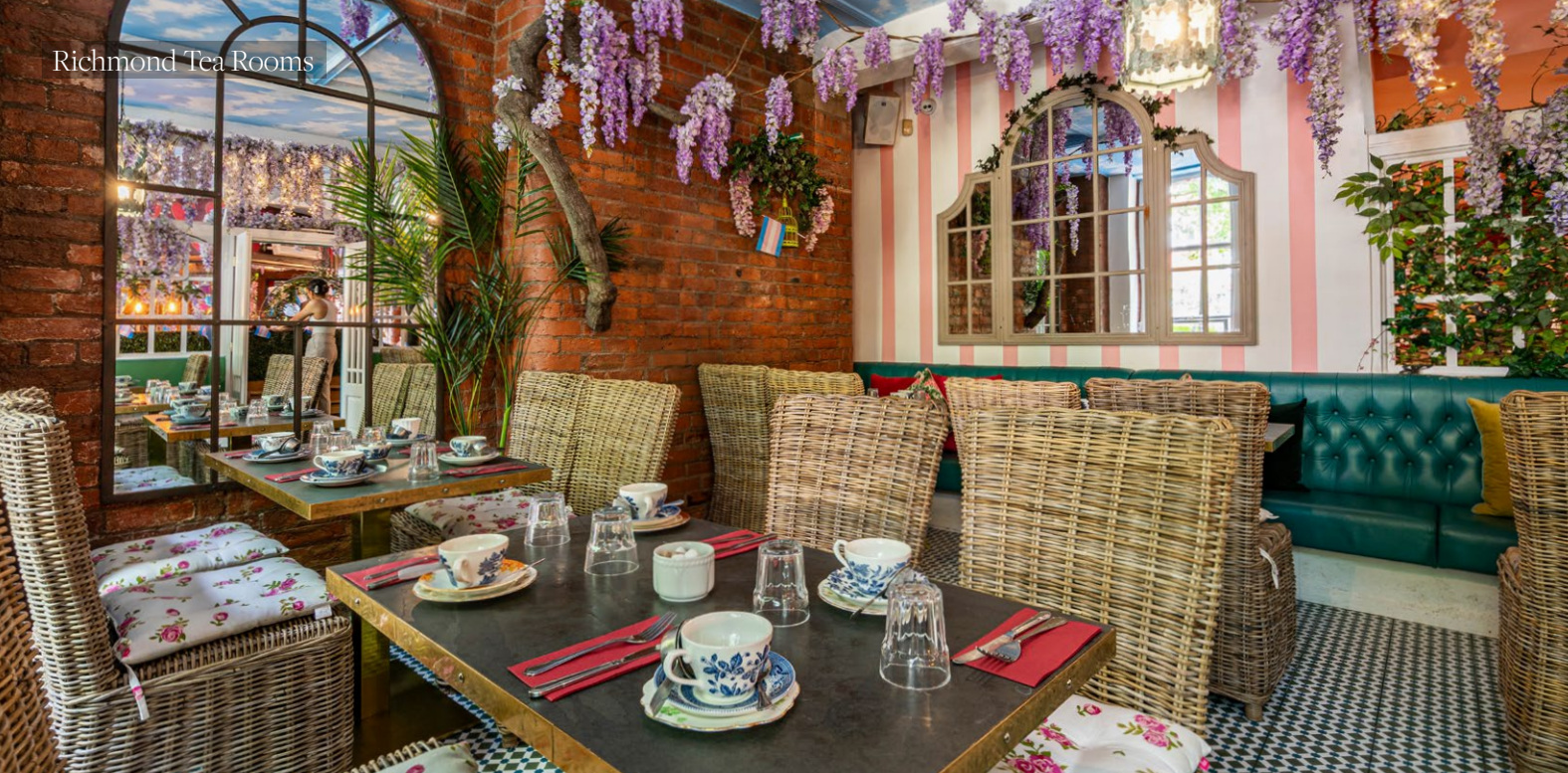
Richmond Tea Rooms