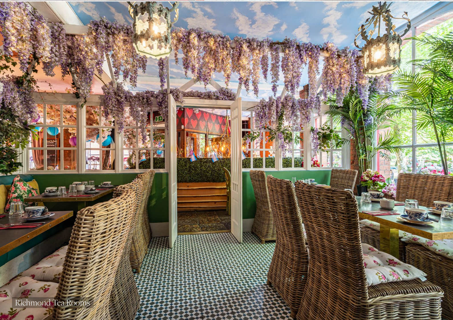
Richmond Tea Rooms