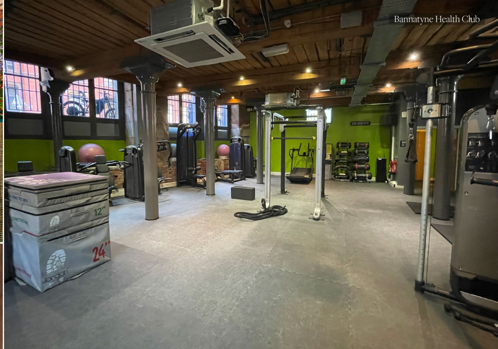
Bannatyne Health Club